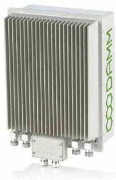
TetraFlex® Outdoor Base Station

The TetraFlex® IP65 encapsulated outdoor base station is well suited to outdoor installations in harsh environments. Together with the system's compact design, it is optimized for direct installation on buildings or masts, securing coverage across the entire airport site. The system can be installed using any combination of outdoor base stations and high-capacity indoor base stations, as required.