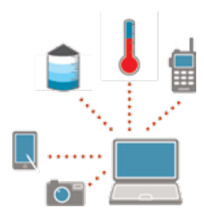
TetraFlex® Packet Data Gateway