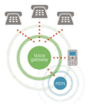
TetraFlex® Voice Gateway

For emergency incidents, TetraFlex® provides emergency calls, man-down facilities and override functions. The useful dynamic group calling feature allows the group assignment of individual handsets, simply through radio commands. This is widely used in airports for the flexible assigning of staff involved in airplane turnarounds at gates, using individual flight numbers.