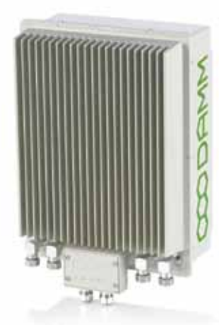
TetraFlex® outdoor base station.

By supporting remote connection, the TetraFlex® Network Management system provides easy access to configuration and surveillance of the entire network and all subscribers. It comes with a Google map, where the alarm status of all site positions is monitored.