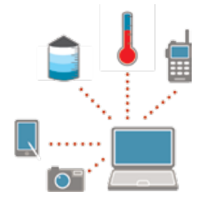
TetraFlex® Packet Data Gateway

TetraFlex® data services provide GPS data for efficient operational dispatching and coordination of vehicle and personnel locations, as well as instantly spotting and responding to mandown situations.